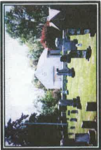
E. Tyn Rhos