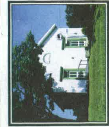
F. Nebo Church