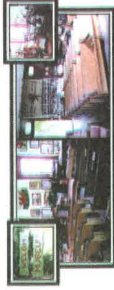
L. Welsh-American Heritage Museum