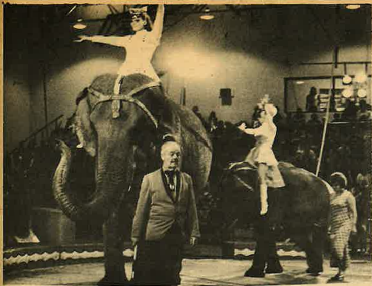
Members of the Royal Hanneford Circus November 2, at Lyne Center.